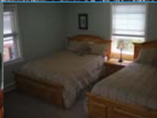
2 Queens Bedroom