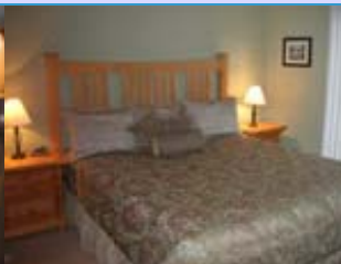
King Master Bedroom